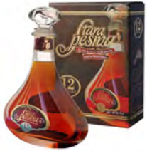
PWI347 SLIVOVITZ 12 YEARS