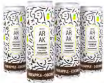
PWI358 MIAMI ARAK PINEAPPLE COCONUT SELTZER