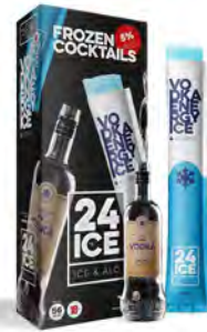
PWI275 24ICE VODKA