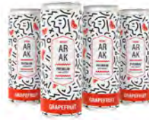
PWI356 MIAMI ARAK GRAPEFRUIT SELTZER