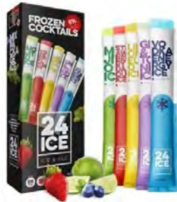
PWI277 24ICE MIX