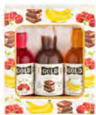
PWI267 GOLD LIQUOR MINI TRI PACK (CHOC/BANANA/ CHERRY)