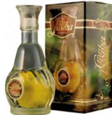
PWI352 PEAR BRANDY WITH PEAR IN BOTTLE