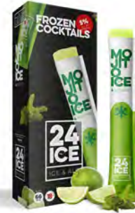
PWI276 24ICE MOJITO