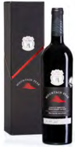
PWI301 MOUNTAIN PEAK