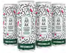
PWI359 MIAMI ARAK WATERMELON SELTZER