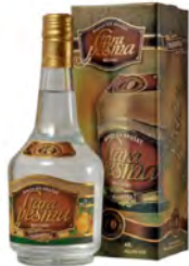
PWI351 PEAR BRANDY