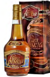
PWI349 SLIVOVITZ 5 YEARS