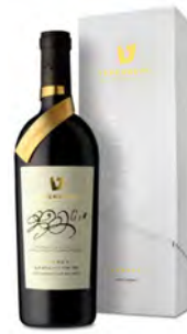
PWI238 LEGACY PETITE SYRAH