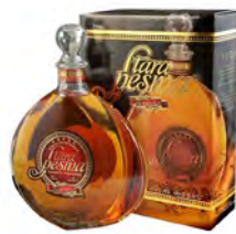
PWI350 SLIVOVITZ 7 YEARS