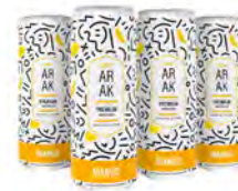
PWI357 MIAMI ARAK MANGO SELTZER