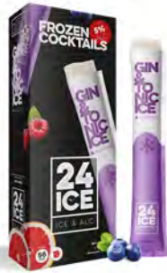
PWI274 24ICE GIN & TONIC