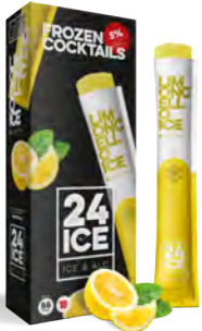
PWI353 24ICE LEMONCELLO