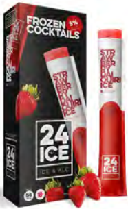
PWI273 24ICE STRAWBERRY