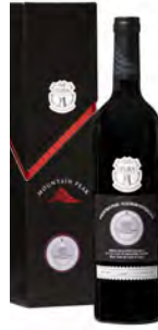
PWI369 MOUNTAIN PEAK PLATINUM