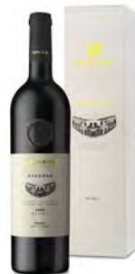
PWI234 ESSENCE MALBEC